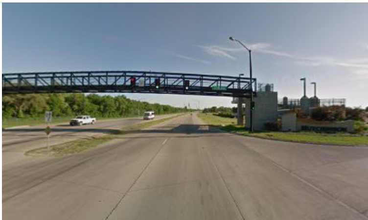
Pedestrian crossing of Hwy 61 at 30 th Street in Hutchinson.