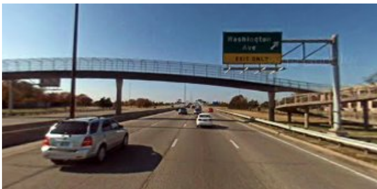
Pedestrian crossing of Kellogg Road near Washington Avenue in Wichita.