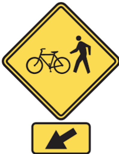
Example of a multi-use path sign

Highly recommend posting “No motorized vehicles” signage. Motorized vehicles should not be on a pedestrian trail.