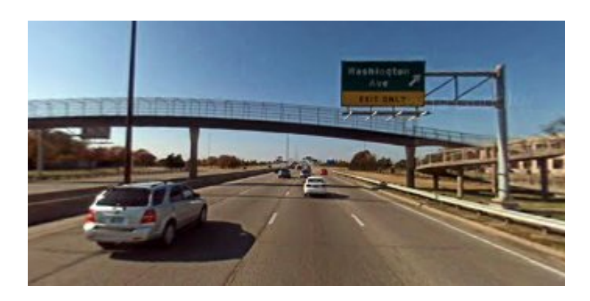
Pedestrian crossing of Kellogg Road near Washington Avenue in Wichita. Google Street View