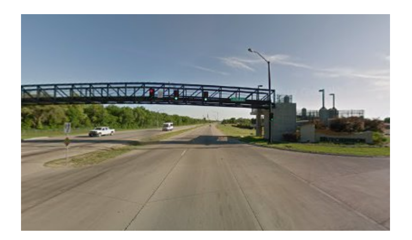
Pedestrian crossing of Hwy 61 at 30^{\text{th}} Street in Hutchinson. Google Street View