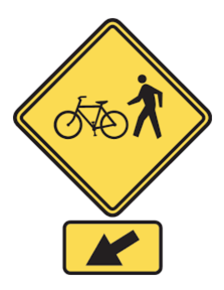
Example of a multi-use path sign

Highly recommend posting "No motorized vehicles" signage. Motorized vehicles should not be on a pedestrian trail.